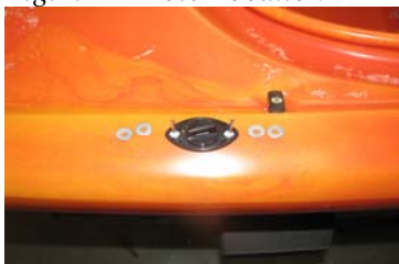
Fig.#4 Rivet in place