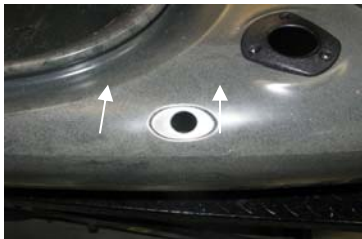
Fig.#1 1" Hole