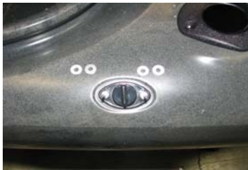
Fig.#2 Screw Location