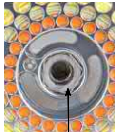
FIGURE 2 (PART #23)

All Access Mid Arbor reels have the drag factory installed for left-hand wind (figure 2). To change your reel to right-hand wind, unclip the one-way retainer (part #23) by squeezing the retaining tags. Remove one-way bearing (part #24) and flip over. Replace clutch retainer.