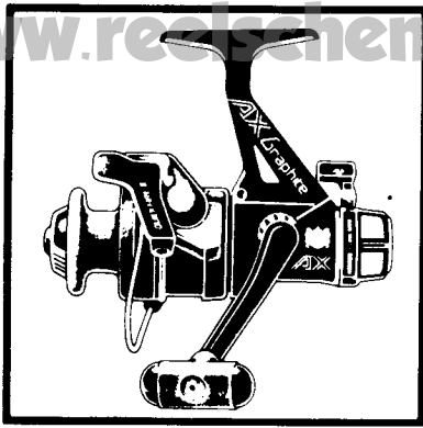
EXPLODED PARTS VIEW AX100Q