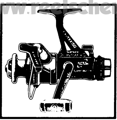
EXPLODED PARTS VIEW SpeedMaster CX2000SQ

Shimano American Corporation, One Shimano Dr. Irvine, CA 92718