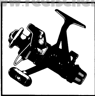
EXPLODED PARTS VIEW SpeedMaster CX2500SQ with Fightin' Star™